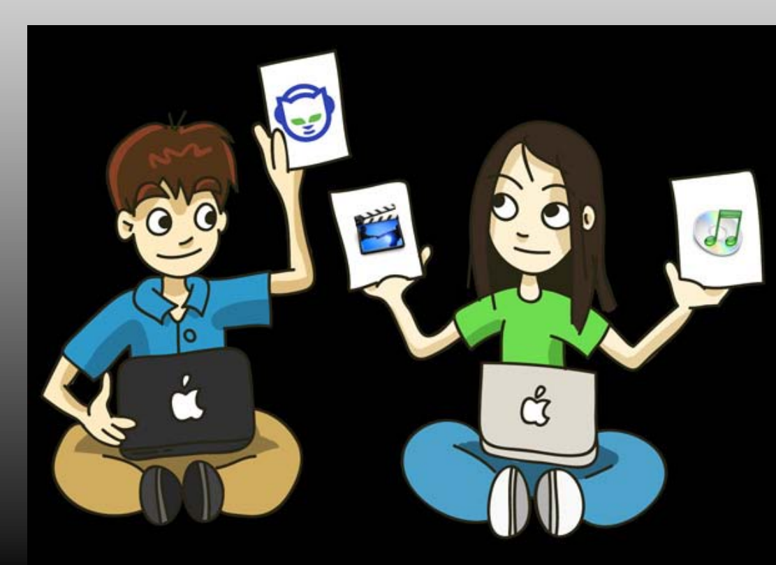
Image from <u>http://resnet.ucsc.edu/besmart/</u> <u>filesharing/filesharing.jpg</u>

•<u>Mary Livermore</u> <u>Library Reserves</u> <u>Copyright Policy</u>